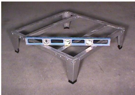
Make sure your stand is level. Thin pieces of metal, under the feet, may be used as shims.

Also double check kiln access. Is it unobstructed? Can the lid or door be operated easily and without obstruction? Is the plug/receptacle or disconnect, needed for emergency disconnect, easily and safely accessible? If the answer is no on any of these questions, reposition the kiln as needed.